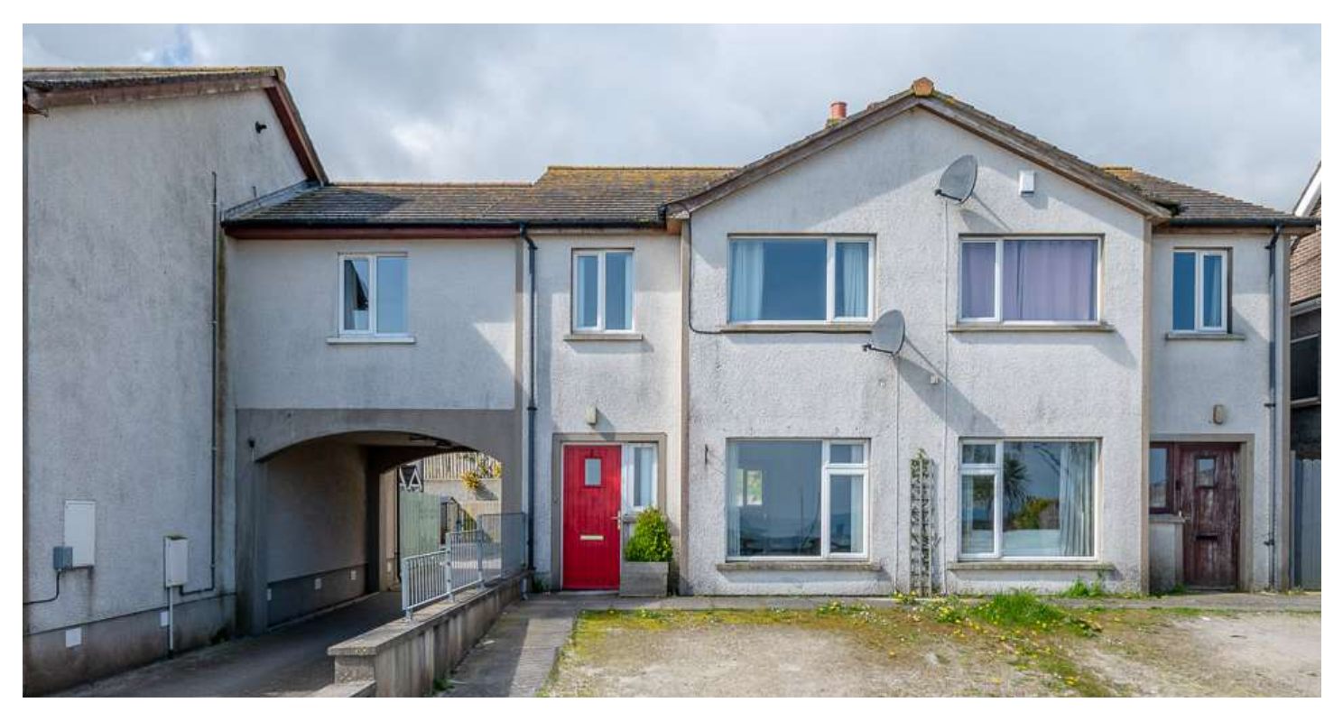
MID TERRACE | 3 ⊨ | 2 ≒ | 2 ⊟

This is an ideal opportunity to purchase a mid terrace coastal property, for the owner occupier, investor or holiday market, with sea views