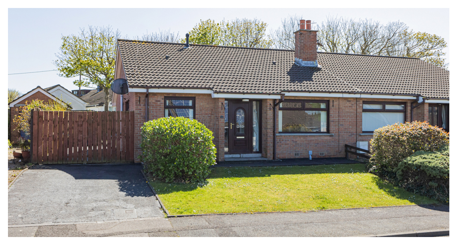
SEMI-DETACHED BUNGALOW | 3 ⊨ | 1 ≒ | 1 ⊟

This attractive semi detached bungalow is located in a quiet cul-de-sac off the Killaughey Road providing excellent convenience to Donaghadees' thriving Town Centre.